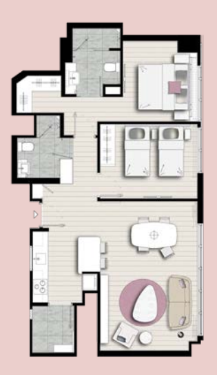
Two-Bedroom Premier Suite