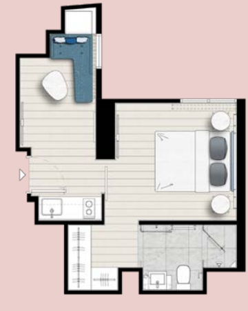
Studio Executive Suite